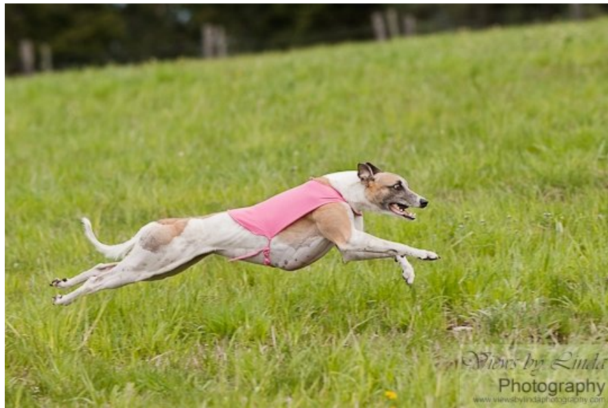
TCS ZOOMERANG – WINNER OF THE 2010 VERSATILITY WHIPPET OF THE YEAR.