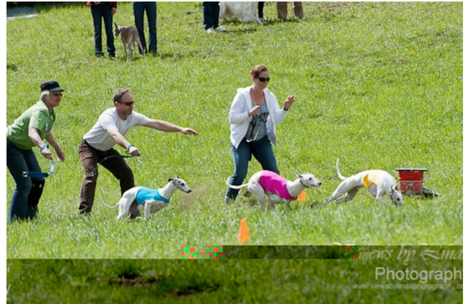
This looks like a white whippet race ☺