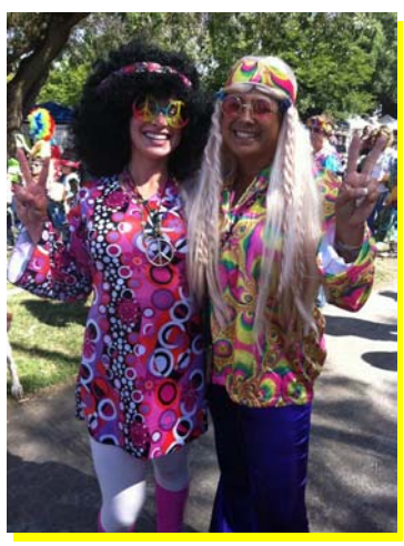
Saturday – May 11 Dress up day at the dogshow! Wear your best 70's outfit