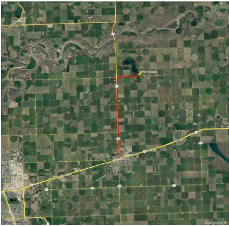
Directions: From Coaldale take Highway 845 north for 9.6 km (app.) to Township Road 102. Turn East and proceed 2.6 km (app.) to the parking area on the north side of Township Road 102.

The CPR Reservoir Conservation lands are managed by the Alberta Conservation Association as a pheasant release site in the fall and has a pond that we may use for a water test or water series. ESSA went to considerable effort to obtain the necessary permission to use this land. We think you will find that these are outstanding lands and ESSA would like to continue to use the CPR Reservoir Conservation lands in the future.