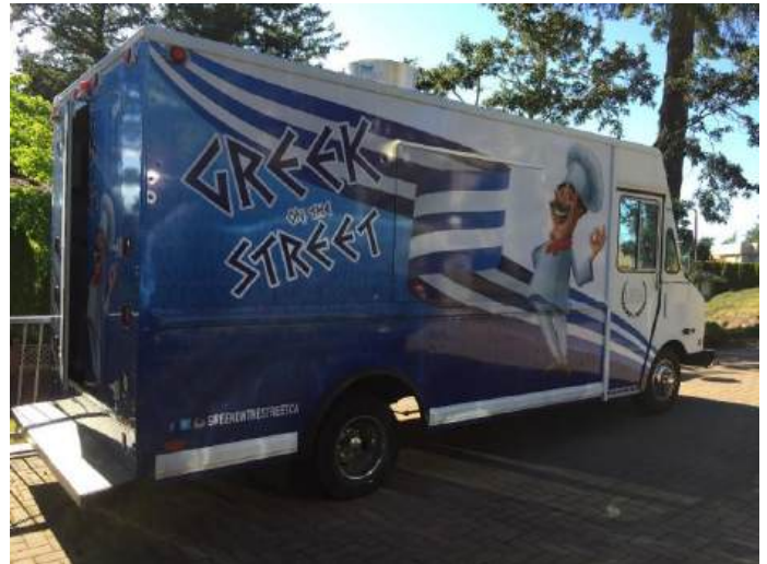
Greek on the Street Thursday thru Sunday