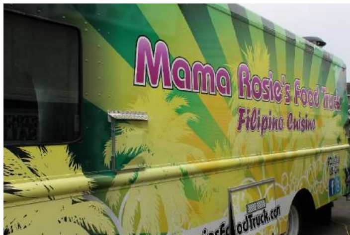
Mama Rosie's Filipino Cuisine Friday-Saturday-Sunday