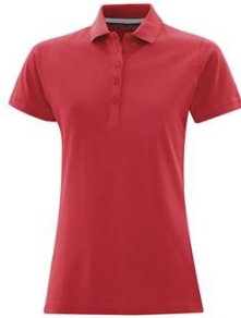
LADIES COAL HARBOUR L4023