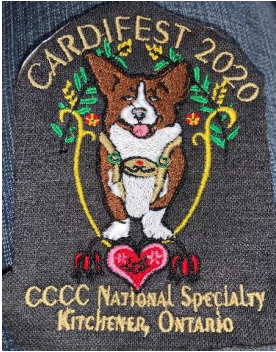
LOGO TO BE EMBROIDERED