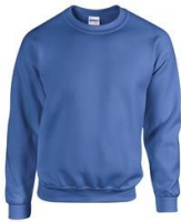
GILDAN 1801 CREWNECK