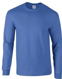
GILDAN 2400 L/S TSHIRT