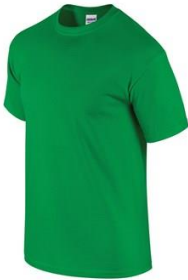
GILDAN 2000 S/S TSHIRT