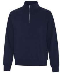
ATC ¼ ZIP SWEATER