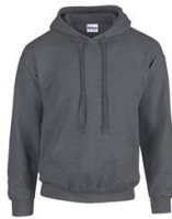
GILDAN 1850 HOODIE