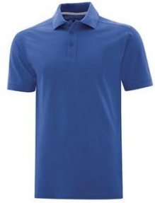
MEN'S COAL HARBOUR S4023